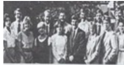
Class of 1984